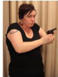
Even the Bartender isn't safe.

It's just a matter of time. The only question is, who will Jack off next?