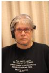
The scary Stage Manager