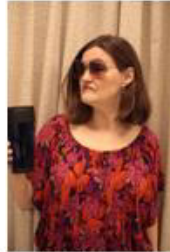
The self-absorbed Star