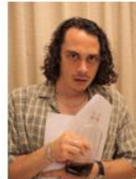
The alcoholic Playwright