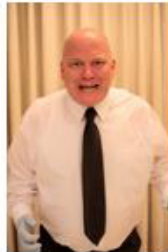
His boss the House Manager