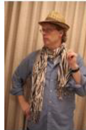
The pretentious Artistic Director